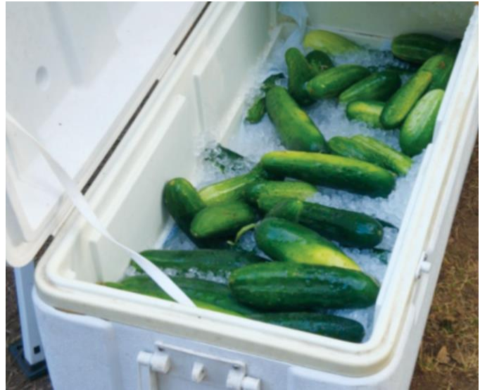
Figure 6. Cucumbers in a cooler with ice.

If you grow and sell fresh produce, and make < $25,000 (3 yr. avg., adjusted for inflation from 2011) in annual sales, you are not covered under the Produce Safety Rule (PSR) and do not need to be inspected.