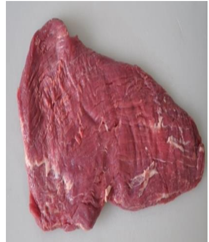
Figure 1. Raw steak

Please keep your most recent copy of your VDACS permit or, for inspected firms, the VDACS firm permit with you at the market.