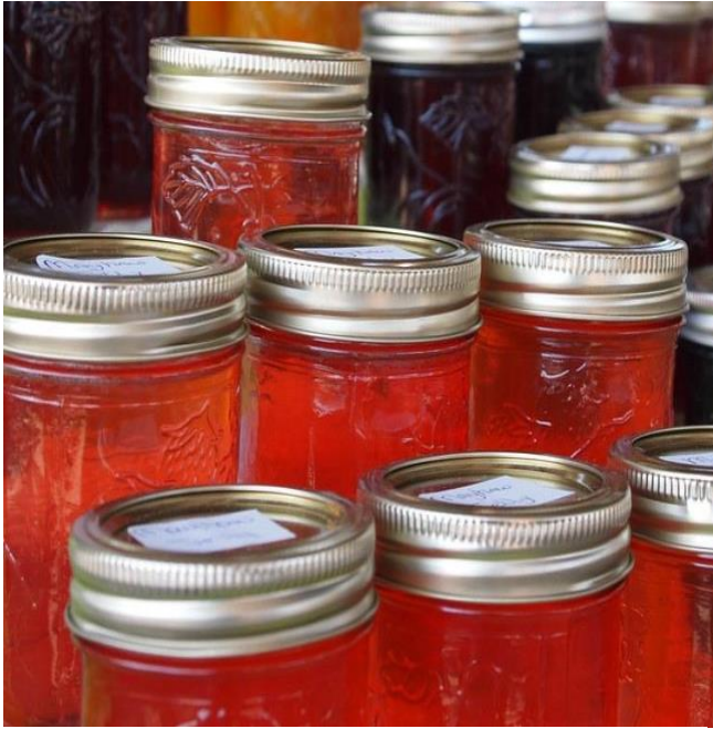
Figure 11. Jams and jellies for sale.