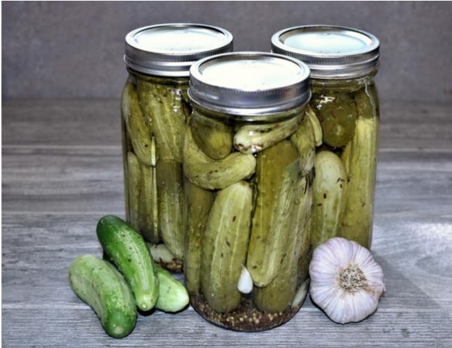
Figure 12. Cucumber pickles in a jar.