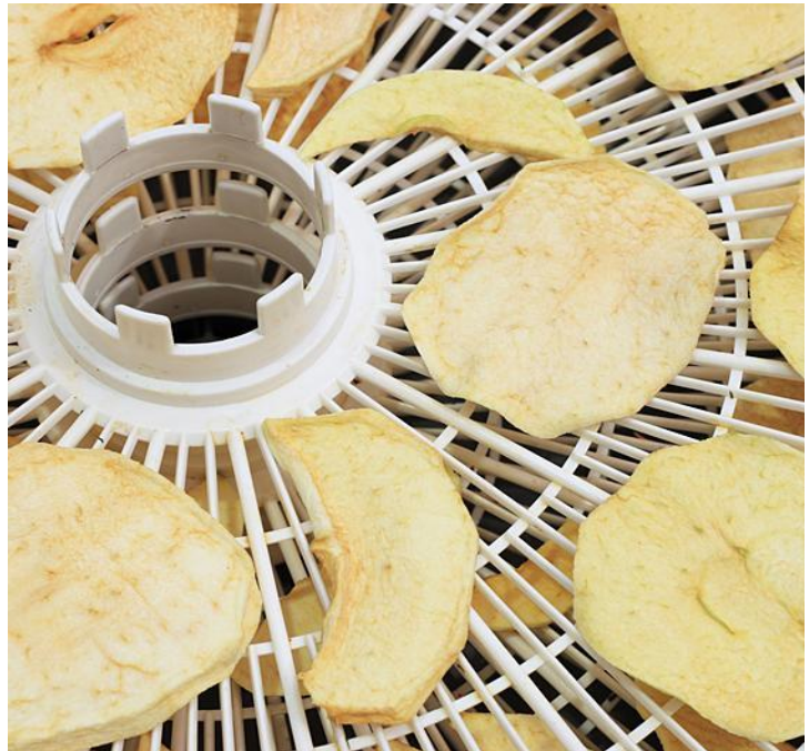
Figure 13. Dehydrated apple slices.

If a dehydration process is done with the purpose of producing a time and temperature control for safety (TCS) food to a non-TCS (i.e., cantaloupe), this product needs a letter from a process authority and cannot be under the exemption.