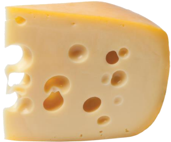
Figure 3. Wedge of cheese.