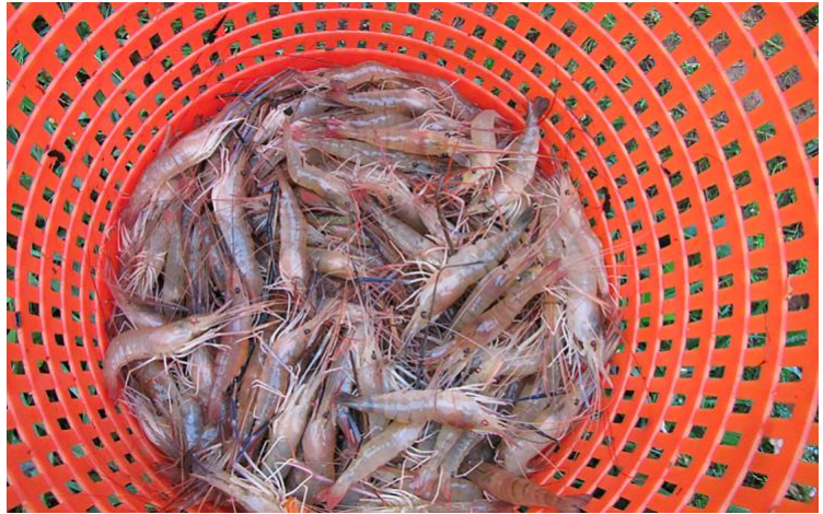
Figure 4. Shrimp from Virginia aquaculture.

The cooking and picking of crab meat intended for sale directly to the end user requires a permit from the VDACS Food Safety Program.