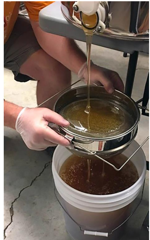
Figure 8. Filtering honey before bottling. (Lily Yang)