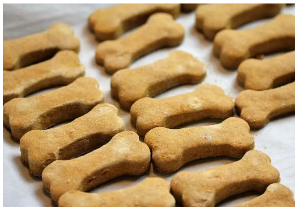
Figure 17. Dog treats on pan.

Pet food/treats can be sold in individual packages or sold in bulk (self-service style) at the farmers market. If the product requires refrigeration, make sure the product is stored in a cooler at 41°F or below and instruct customers to store at those temperatures following the purchase as well. For non-refrigerated products, store in dry containers that you can keep at room temperature.