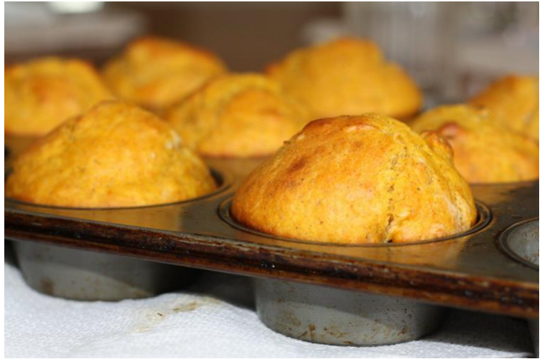
Figure 10. Muffins in a pan.

These products cannot be sold wholesale/sold to other businesses (i.e., grocery stores) for resale, on the internet, or across state lines.