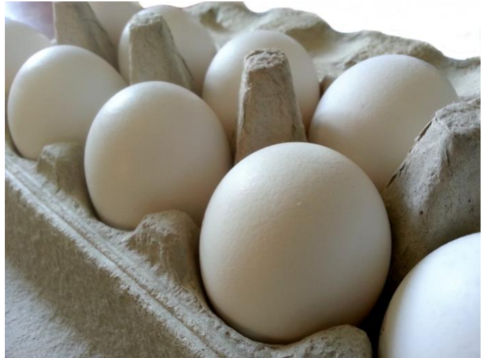
Figure 9. Shell eggs in a carton.