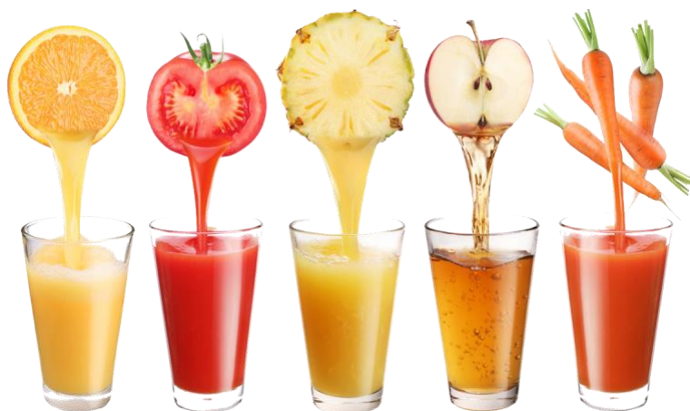
Figure 16. Variety of juices.

Beverage service : To sell juice that is being prepared at the farmers market, you will need to contact VDH.