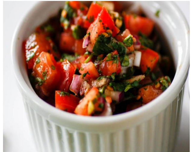
Figure 14. Fresh tomato salsa.

Frozen foods must be kept frozen which is very difficult to maintain without mechanical equipment.