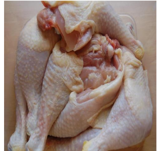
Figure 2. Raw poultry pieces.

Keep frozen products frozen and other products at 41°F or lower. Please keep your most recent copy of your VDACS permit or, for inspected firms, the VDACS firm permit with you at the market.