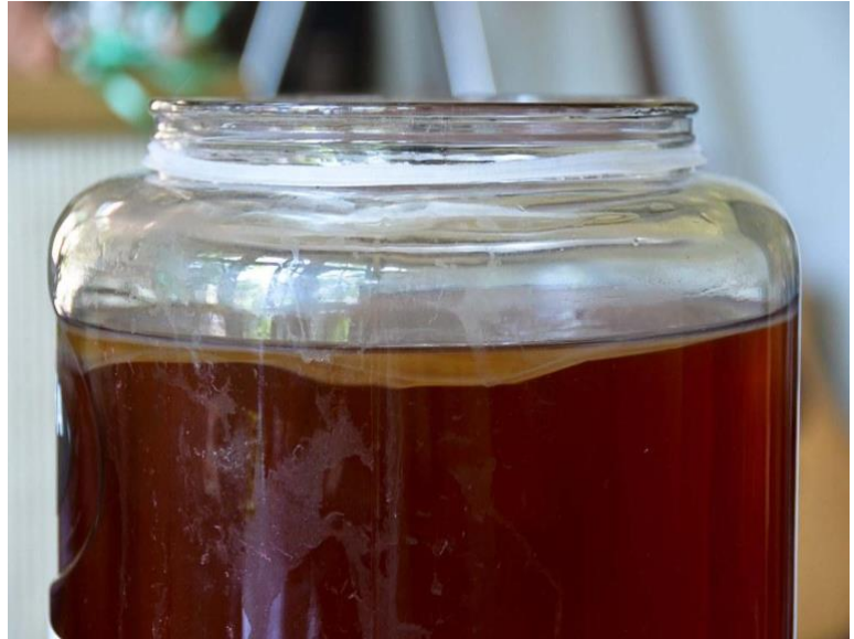
Figure 15. Kombucha with mother.

The only reliable way to confirm that your product has less than 0.5% alcohol is to test it. You should test your finished product at the time of bottling as well as the unpasteurized bottled product after weeks of storage. You may have to limit the time for sale at market (shelf life) if the alcohol content rises above 0.5%. Additionally, if at any time during the production, storage, or sale, your kombucha exceeds 0.5% ABV, you will be subject to alcoholic beverage regulation, regardless of whether you dilute the product prior to sale.