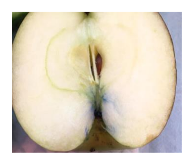
Infiltration of aniline solution into apples through the blossom scar.