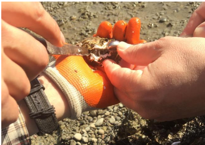
Figure 2 a. Inserting a Smart Button data logger probe into an oyster

Temperature data loggers collect quantitative time-series data about temperature variability in seafood processing and supply chains. They are activated via hardware or blue tooth interface to a computer or smartphone with manufacturers' software. Sampling intervals, start times, and time-temperature alarms can be manually adjusted using the software. Temperature data loggers are installed by inserting in, or attaching to, products or packaging.