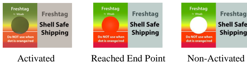
Figure 1. Smart Shellstock TTI label by Vitsab®.

Time temperature data loggers are equipment that digitally measure or continuously monitor and record the temperature of seafood during harvest, processing, cooking, storage, and transit.