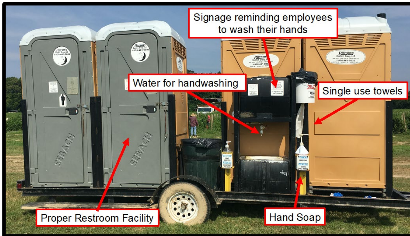
Figure 3. Clean restroom facilities, water for handwashing, hand soap, and single use towels must be available for employees and located near working areas that are easily accessible.

from fields and storage areas). Toilet and handwashing stations must be supplied with single use towels, hand soap, toilet paper, potable water for handwashing, and a catch basin for greywater (Figure 3). The presence and availability of these materials should be monitored and well stocked. All toilet and handwashing stations must be serviced and cleaned on a scheduled basis, which is based on size of farm and/or number of employees and frequency of visitors. Records on the maintenance, cleaning, stocking, etc., of toilet and handwashing stations should be kept.