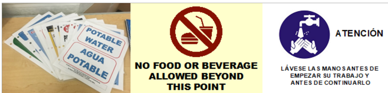
Figure 2. Effective signage will remind and inform employees and visitors of food safety practices on the farm. Signs should be easily understood and placed in locations that are easily visible.

Required signage (e.g., rules for visitors, bathroom and handwashing stations, designated break areas, drinking water vessels, chemical storage, first aid kit locations, traceability system coding, areas that are off limits, etc.) should be posted to instruct or remind employees and any visitors of the farm's food safety practices or show them where important items or facilities are located (Figure 2). When developing employee signage, signage should be easily understandable in a language all employees can understand and should use pictures or graphics for those who may not be able to read. Signage should always be posted in a visible location in which other materials aren't distracting.